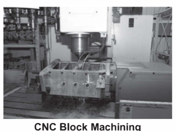
CNC Block Machining