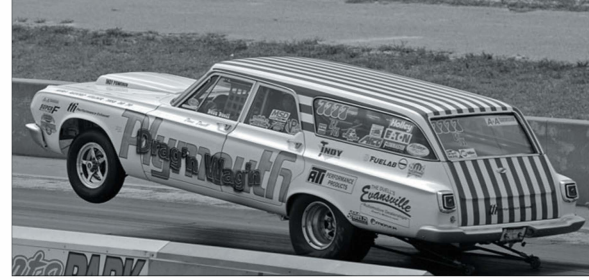
Doug Duell's 540 Bracket Master 9.30@144

816 / .765 -- .284 / .300 AVAILABLE WITH-MAXX ALUMINUM BLOCK-CALLIES CRANK-STEEL RODS-COMP ELITE LIFTERS-TREND PUSHRODS-2.350-TITANIUM INTAKE VALVE MAKES 940HP-CUSTOM CARB